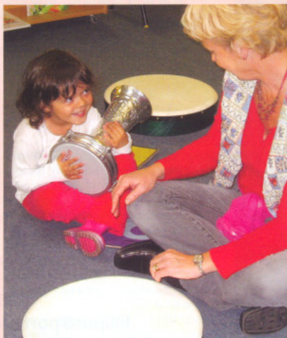
A Turkish drum provides an introduction to Middle Eastern cultures to accompany learning about relevant countries

■ For further information go to www.worldbeaters.co.uk