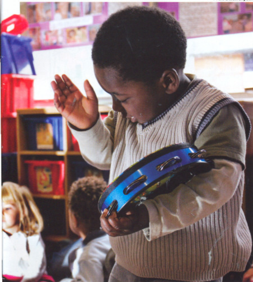
Children at Fortune Park Early Years Centre have learned respect for instruments